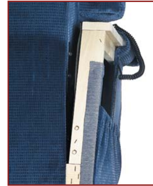
501 M shown