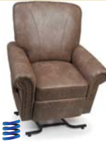
pocketed coil spring seat std.