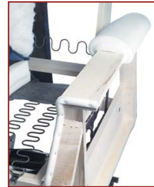
501 M shown

Each luxury lift & recline chair is hand crafted in our facility using decades of motion furniture experience.