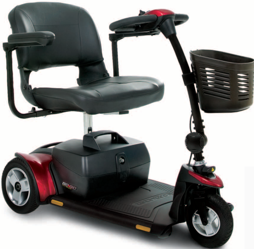
Go-Go Elite Traveller® Plus, 3-Wheel

The Go-Go Elite Traveller® Plus was designed to bring travel scooters to a greater range of people than ever before. An increase in length and width, and a weight capacity of 300 lbs. (325 lbs. w/HD version) combine with wraparound delta tiller to allow both the larger individual and those with limited dexterity to experience the benefits of a travel-specific mobility product for the first time. One hand feather-touch disassembly makes the Go-Go Elite Traveller Plus the easiest travel scooter to take along anywhere.