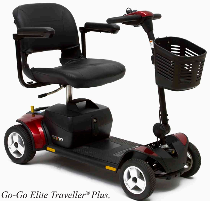
Go-Go Elite Traveller® Plus, 4-Wheel

The Go-Go Elite Traveller® Plus was designed to bring travel scooters to a greater range of people than ever before. An increase in length and width, and a weight capacity of 300 lbs. (325 lbs. w/HD version) combine with wraparound delta tiller to allow both the larger individual and those with limited dexterity to experience the benefits of a travel-specific mobility product for the first time. One hand feather-touch disassembly makes the Go-Go Elite Traveller Plus the easiest travel scooter to take along anywhere.