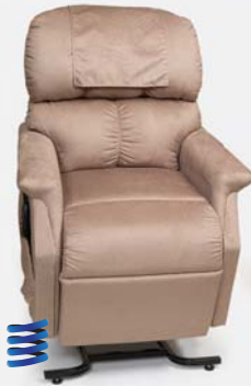
Comforter Small PR-501S