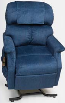
Comforter Junior Petite PR-501JP