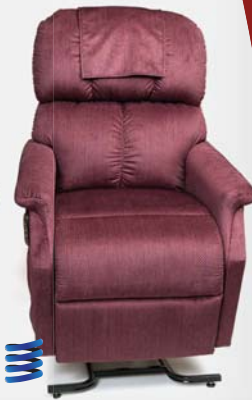
Comforter Tall PR-501T