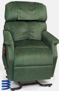
Comforter Large PR-501L